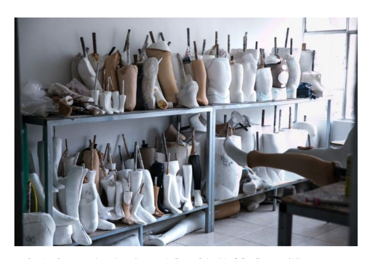
Caption: Storage at the orthopedic center in Pasto, Colombia.